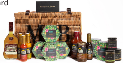
THE KINGSTON HAMPER