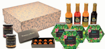
THE CARIBBEAN HAMPER